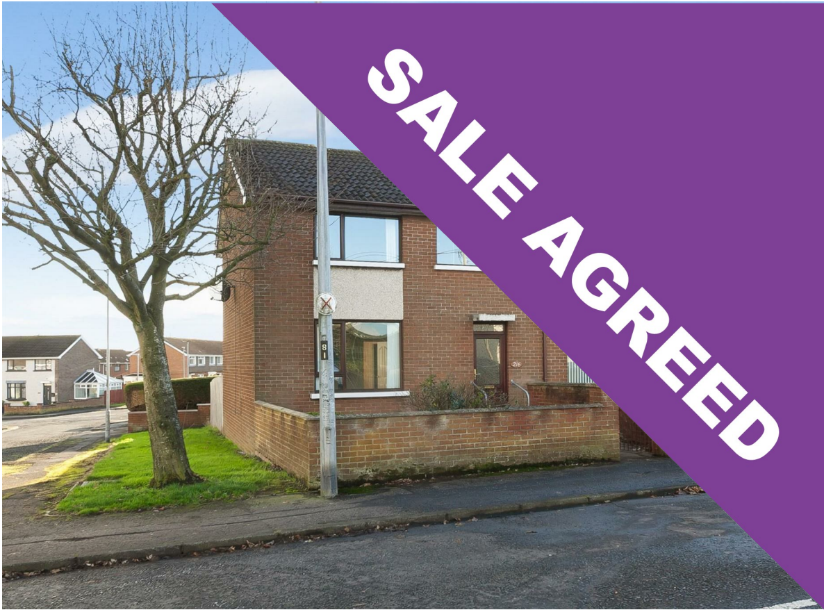
216 Jordanstown Road, Newtownabbey, BT37 0NA